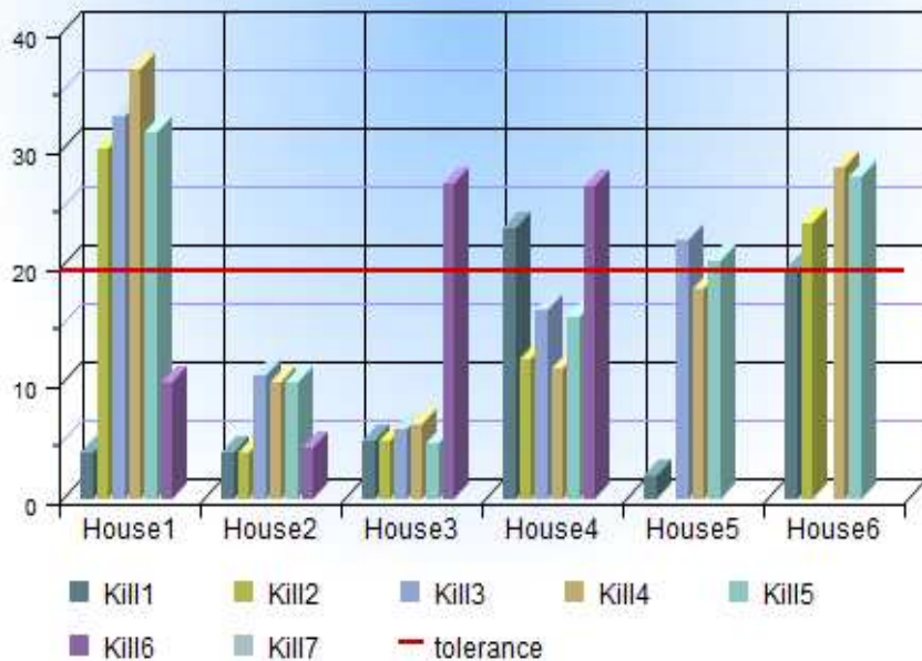
HockBurn Vs Tolerance