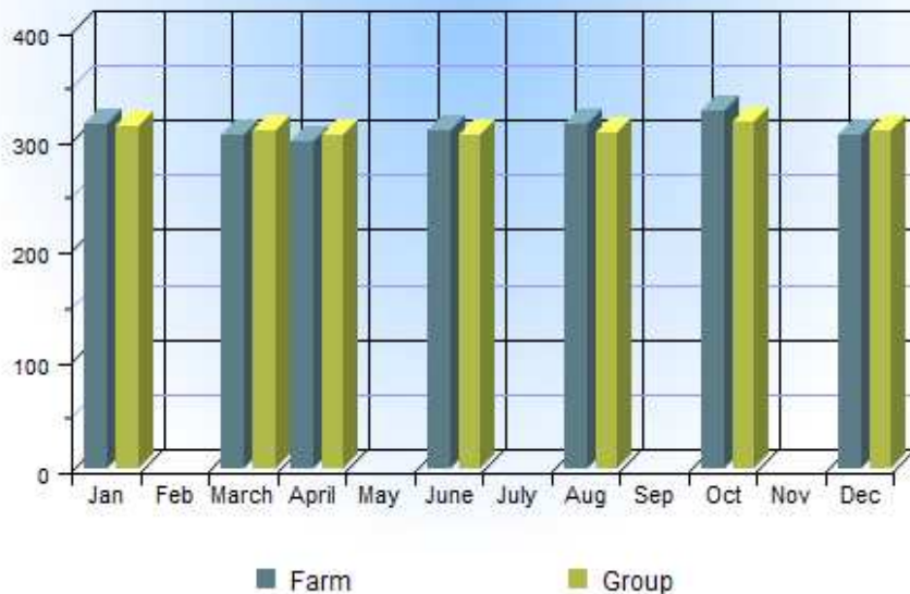
EEF Vs Average